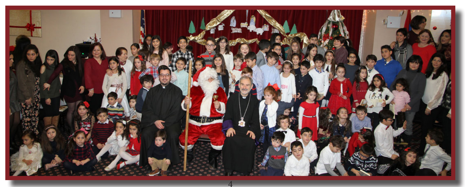
Շողակա / 2018

Despite the bitter cold, a packed house attended and warmed the Main Hall with enough love to melt the ice and snow outside.